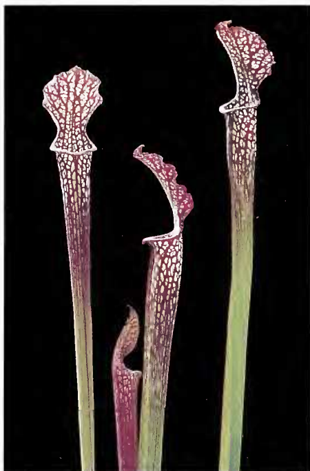
Figure 4: Sarracenia 'Spatter Pattern', photo E.M. Salvia.